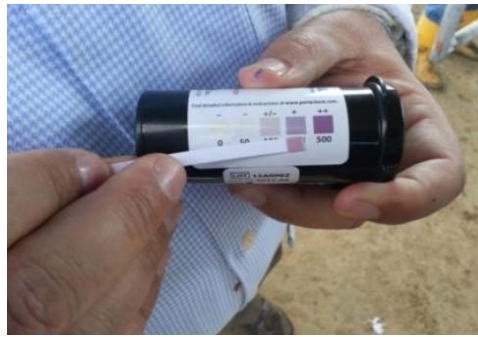
Figure 2 the change in the color of PortaBHB milk ketone test strips on milk samples.