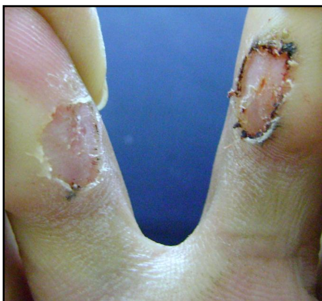
Fig. (21): The same patient after removal of the black tissue showing complete response.