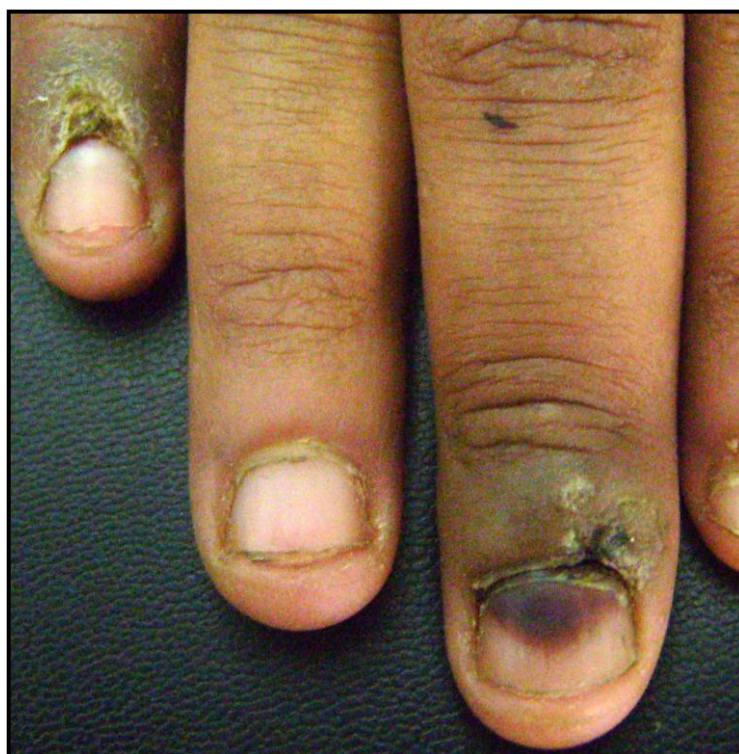
Fig. (28): The same patient in the 3 rd visit (after 2 injections) showing blackening of the nail after 5-FU injection.