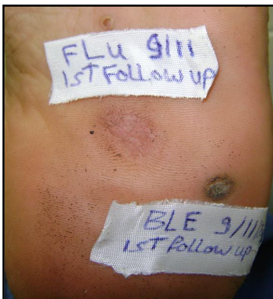
Fig. (23): The same patient in the 2 nd visit (after 1 injection) showing complete response of the 5-FU injected wart and partial response of the bleomycin injected wart.