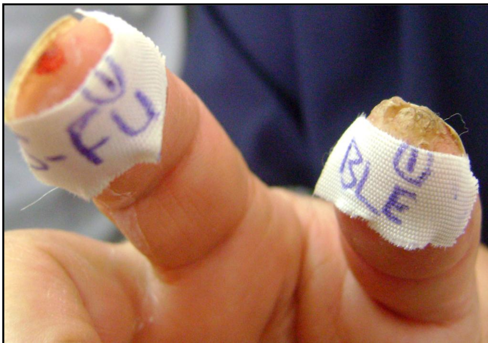
Fig. (25): Two periungual warts in the 1 st visit.