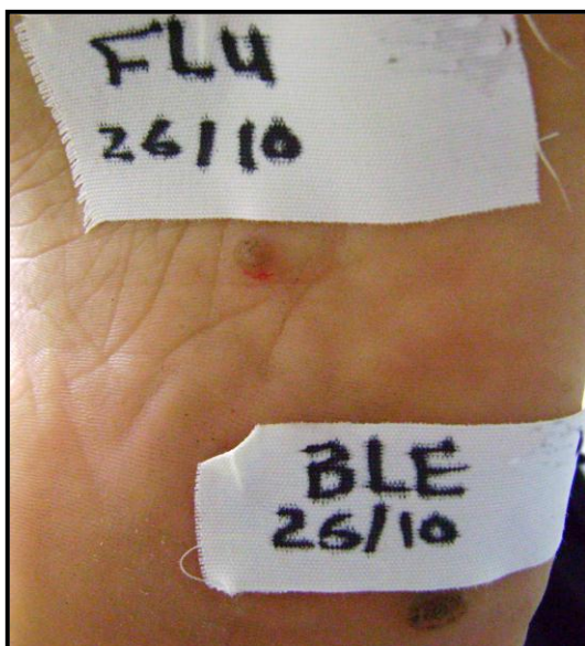
Fig. (22): Two plantar warts in the 1 st visit.