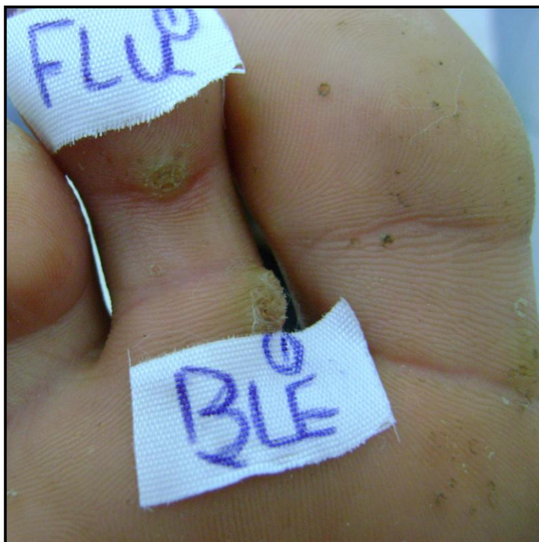
Fig. (17): Two plantar warts in the 1 st visit before 5-FU and bleomycin injections.