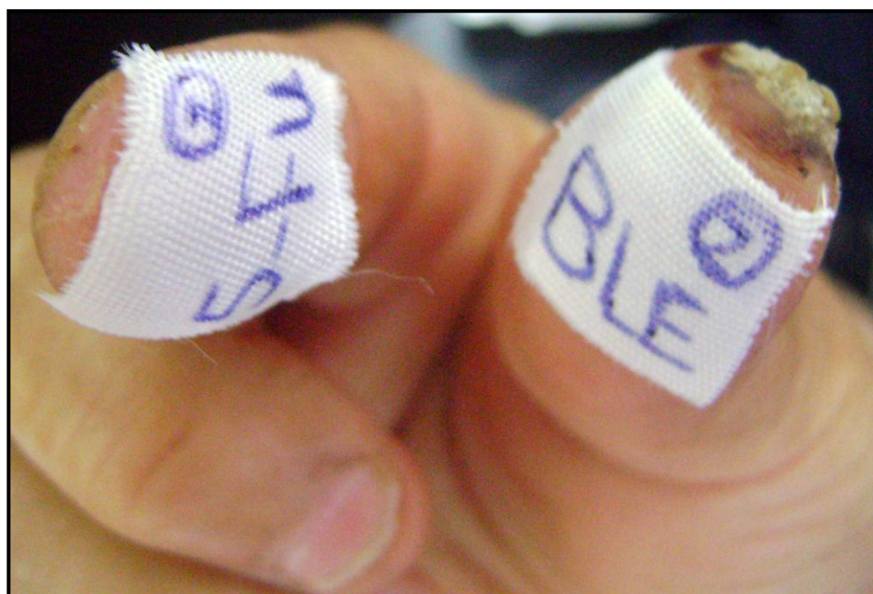
Fig. (26): The same patient in the 2 nd visit (after 1 injection) showing bullae in the bleomycin injected wart and complete response of the 5-FU injected wart.