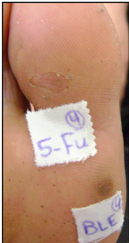
Fig. (32): The same patient in the 4 th visit (after 3 injections) showing complete response of the 5-FU injected wart and partial response.