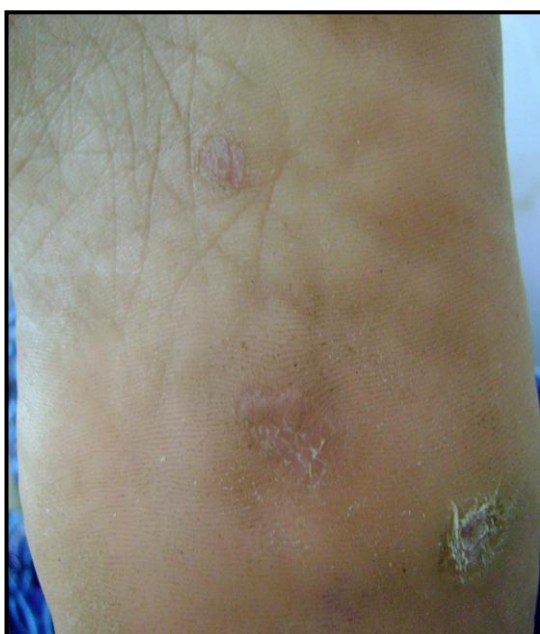
Fig. (24): The same patient in the 3 rd visit (after 2 injections) showing complete response in both bleomycin and 5-FU injected warts.