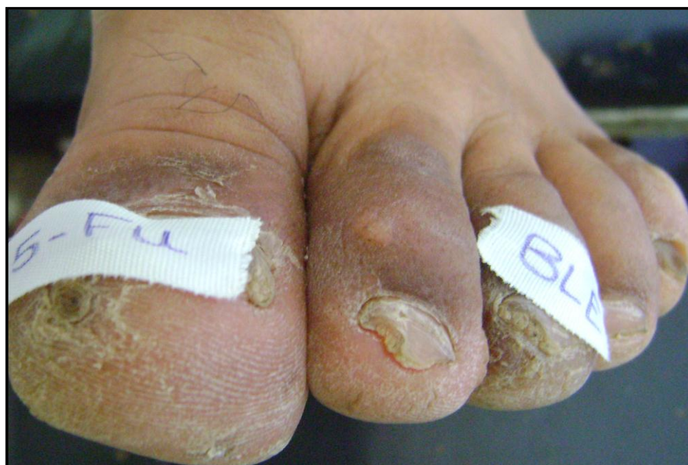
Fig. (30): The same patient in the 5 th visit (after 4 injections) showing partial response in both bleomycin and 5-FU injected wart.