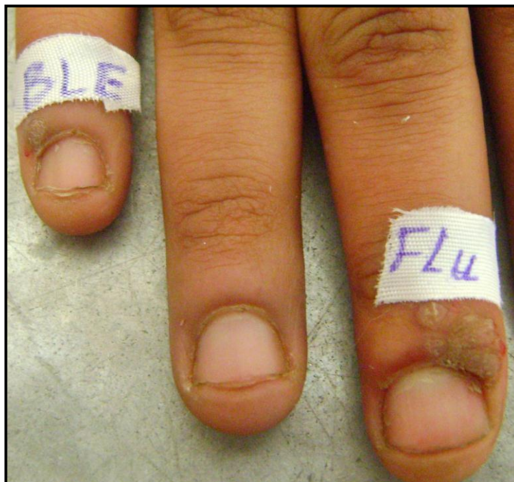
Fig. (27): Two periungual warts in the 1 st visit.