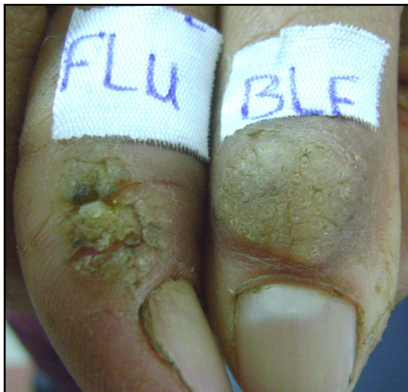
Fig. (11): Two periungual warts in the 1 st visit before 5-FU and bleomycin injections.