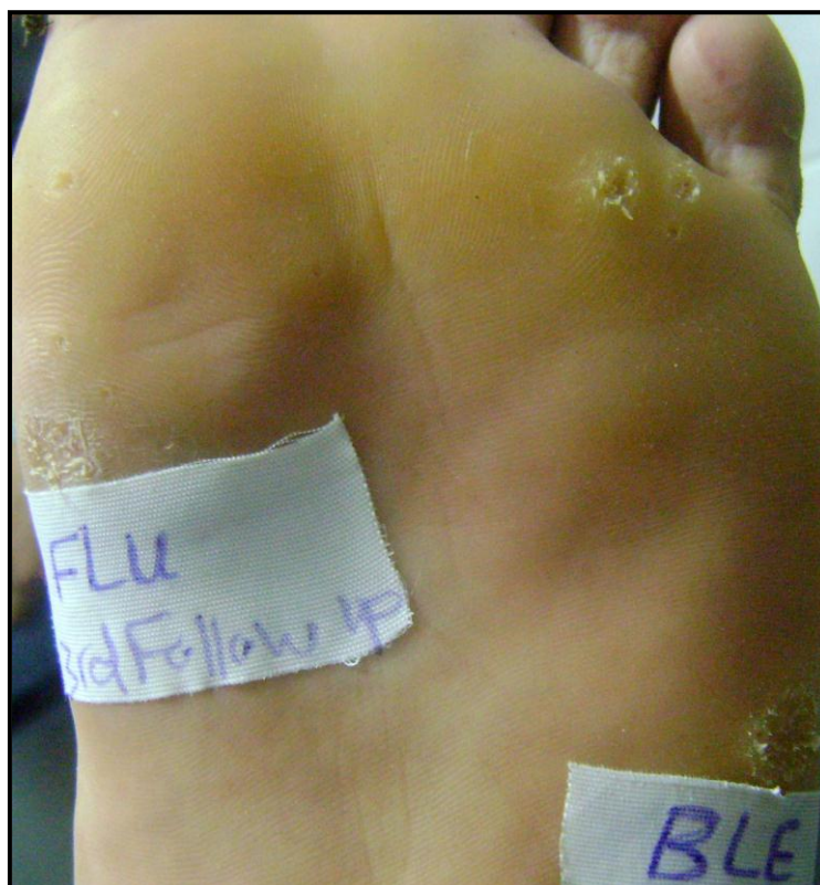
Fig. (16): The same patient in the 3 rd visit (after 2 injections) showing complete response in both bleomycin and 5-FU injected warts.