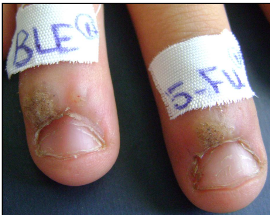
Fig. (13): Two periungual warts in the 1 st visit before 5-FU and bleomycin injections.