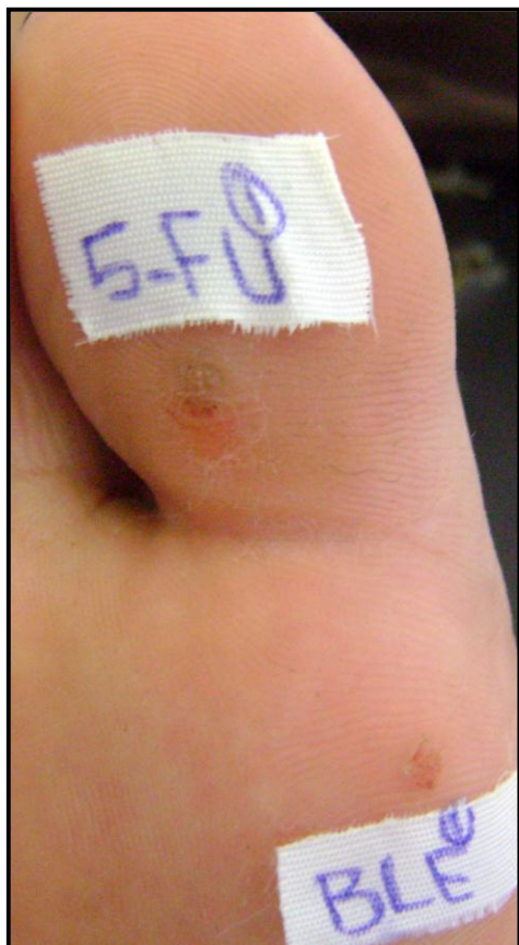
Fig. (31): Two plantar warts before 5-FU and bleomycin injections.