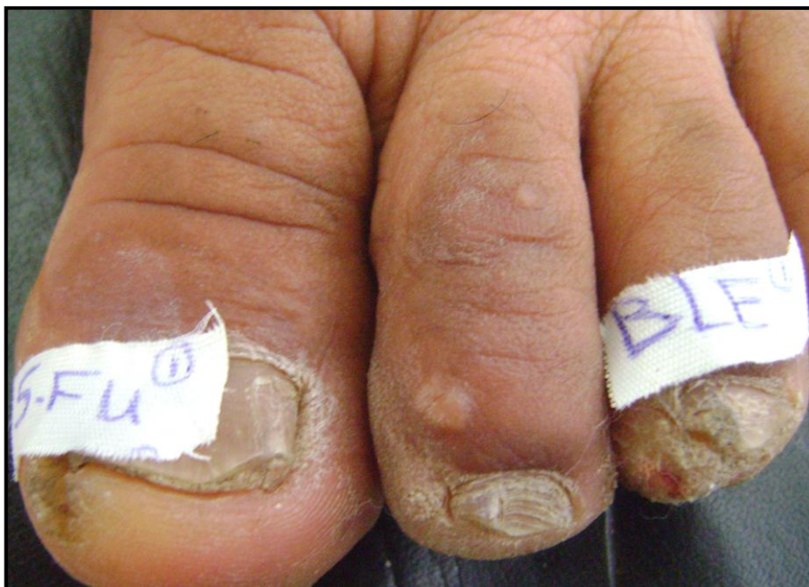
Fig. (29): Two periungual warts in the 1 st visit.