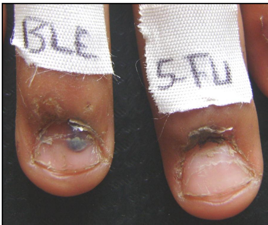
Fig. (14): The same patient in the 4 th visit (after 3 injections) showing complete response in both bleomycin and 5-FU injected wart.