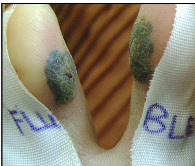
Fig. (20): The same patient showing blackening of the two warts in the 2 nd visit (after 1 injection).