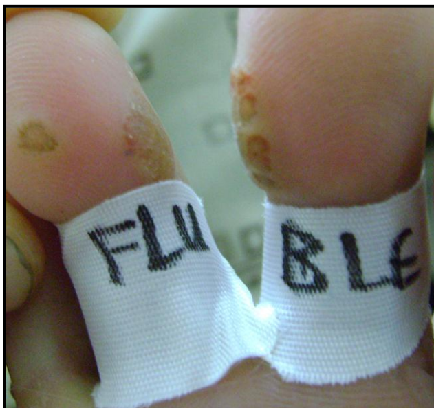
Fig. (19): Two plantar warts in the 1 st visit before 5-FU and bleomycin injections.