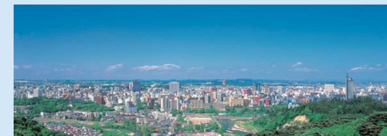
A view from Aobayama campus

Sendai is located about 300 km north of Tokyo on the Pacific coast of Honshu Island with a population of over one million people. In Sendai, students can experience the beauty of the four seasons as well as visit nearby beaches, ski resorts, and onsens (hot springs). Sendai has mild winters with little snow and warm summers. Throughout the year, in the Sendai area, there are a wide variety of cultural and sports events, which provide opportunities to experience first hand aspects of Japanese culture.